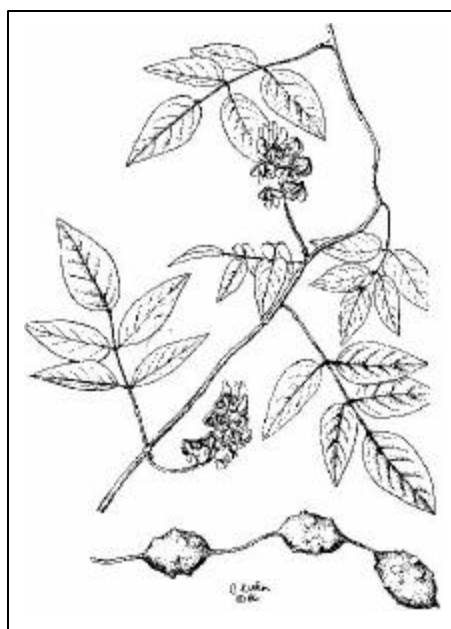
Figure A3-1 Groundnut ( Apios tuberosa ) 1