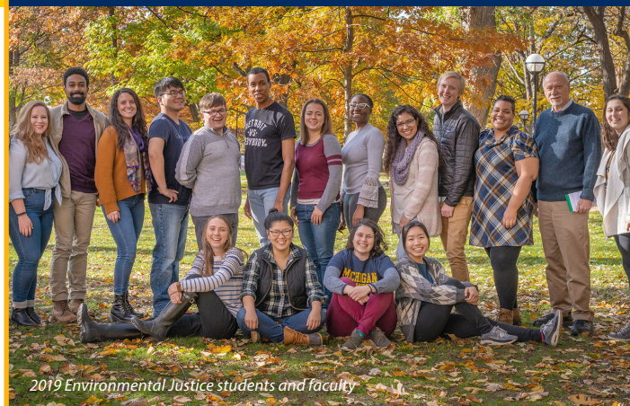
2019 Environmental Justice students and faculty