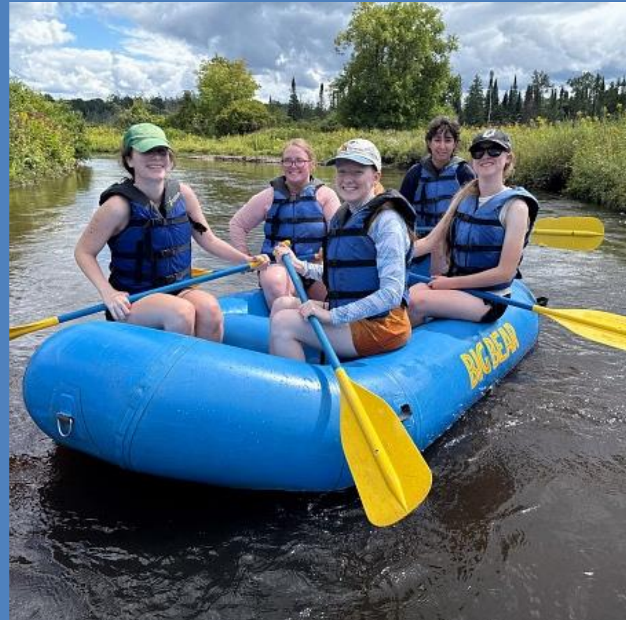
Pictured above are five SEAS students enjoying a river rafting experience at the Biostation