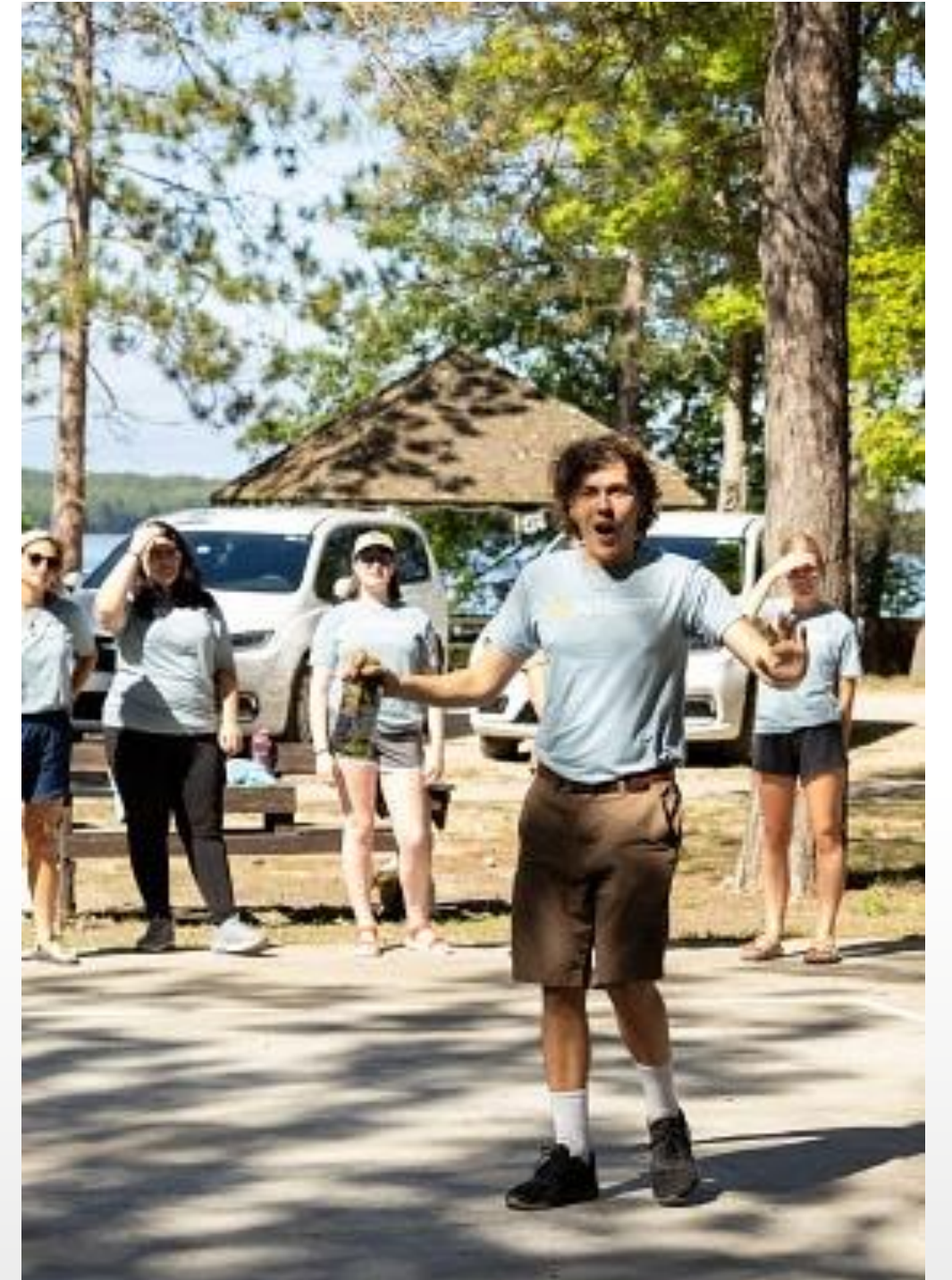
Pictured above is a SEAS Student Leader leading a fun get-to-know-you activity at the Biostation.